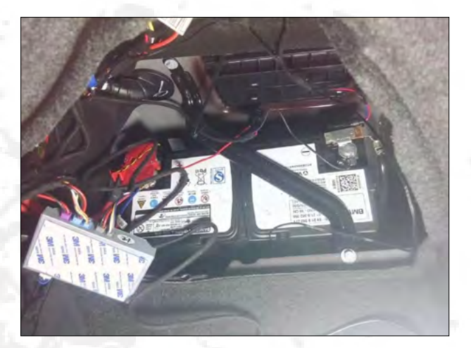
13.Find the battery under the brace rod.