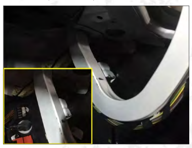
6.After installing the bracket, find the position as shown in figure.