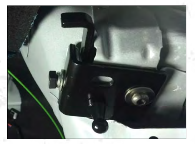
5.Front bracket installation completed.