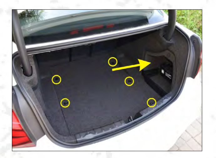
1.Remove the button as shown in the figure. Remove the tailgate cover and the right trim panel.

Refer to the parts list and accessroy drawings to check if the accessories are complete. After the product is installed, press the tailgate button for 3-5 seconds. You will hear a sound "DI———" and then loose your hand. Press the tailgate button again and close it. You will hear two sounds. Tail gate learing is finished.