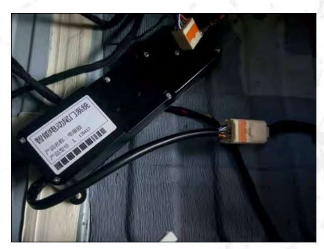
18.Connect the plug of our electric suction cable with the motor socket.