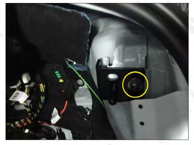
3.Install the bracket and fix it with the screws.