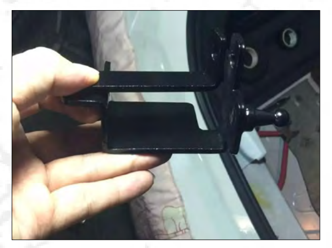
7.Schematic diagram of the positiion of the bracket. (Note: The bracket with the ball head is on the "7" shaped bracket. The photo position is only for better display.)