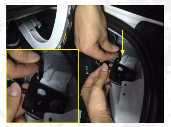
4.Insert our "7" shaped bracket into the hole and install it behind the bracket (Pictured).