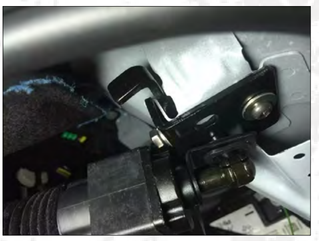
10.Install the front of the brace rod.