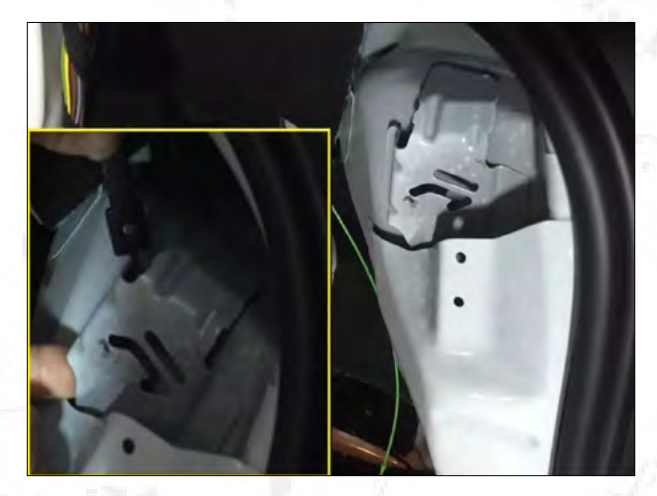
2.Find the position shown on the right side of the car and insert the iron into it.