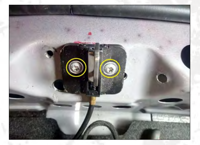
16.Remove the original car lock, install our electric suction lock and use the original car screws to fix it.