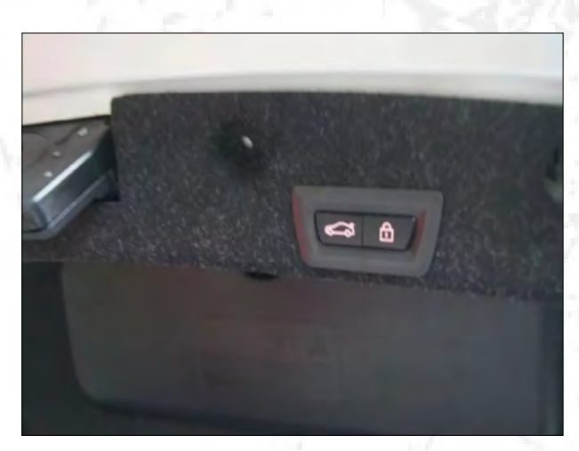
22.As shown in the figure, install our tailgate switch.

If the door cannot be closed after the isntallation is completed. Remove the buffer rubber, as follow: