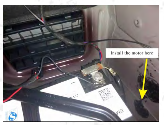
17.Motor installation position. Fixed with our 3M paster.