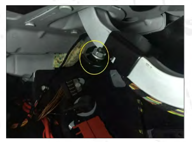
9.Fix the bracket with screws as shown in the picture.