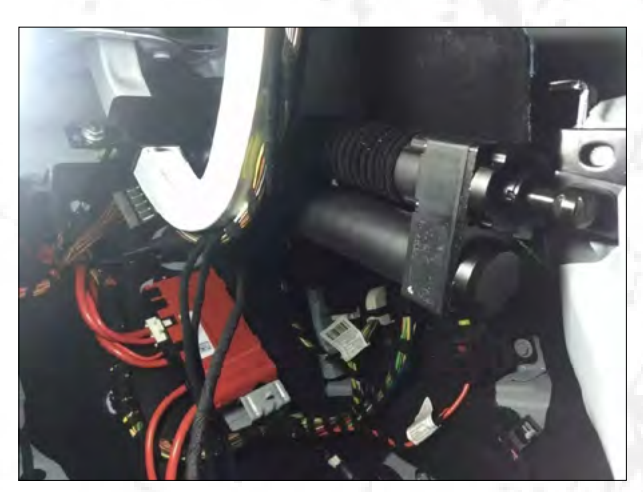
12.Brace rod installation completed schematic.