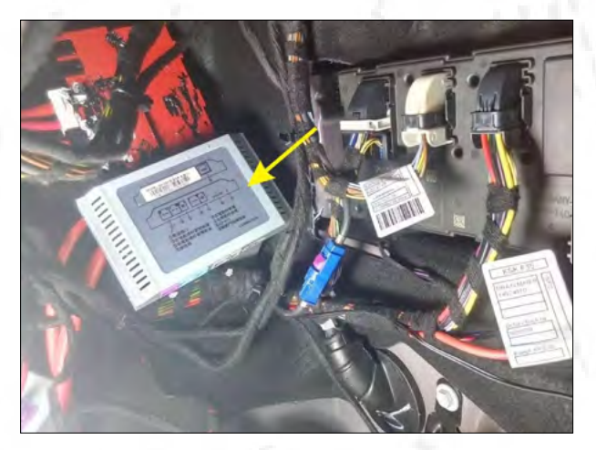
21.Fix the control box with our 3M paster. Install the Hall line socket, the electric suction cable socket and the power cord socket one by one. Check if the socket is inserted.

20. The control box installation position.