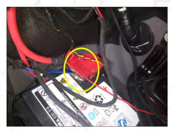
14.Our power supply is connected to the positive.